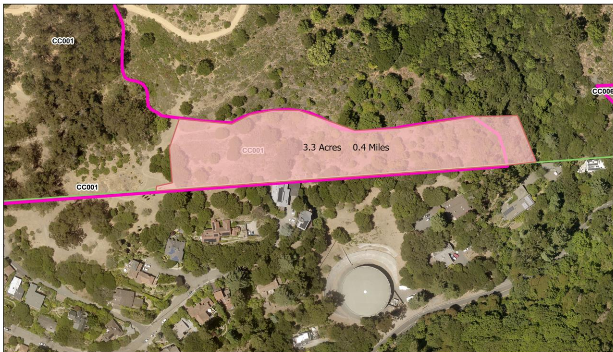
cc001 Diablo Crew 2023